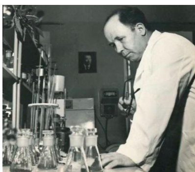
Figure 1. Professor Andrei Mikhailovich Grodzinsky at the laboratory.

A.M. Grodzinsky drew up a scheme of donor-acceptor interaction of plants in biogeocenoses through root secretions, volatile phytogetic (phytoncide) compounds and products of biochemical activity of soil microorganisms; established the function of allelopathy in the formation of the structure, stability and productivity of phytocenoses. Philosophical definition of the essence of allelopathy (cycle of physiologically active substances that regulate internal and external relationships, renewal, development and change of vegetation in biogeocenoses).