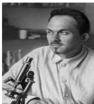
Figure 3. Mykola Hryhorovych Kholodny.

Master's degree in Microbiology. During 1912-1915 he developed the basic methodology of microbiological soil research, prepared a practical course in Microbiology and studied the thermophilic denitrifying soil bacteria. In 1919 he received Master's degree in Botany. In 1920, he was appointed Professor, Kiev Institute of Public Education. In 1933, he established Biology Faculty at University of Kiev, with independent Department of Microbiology. He studied the soil microflora and became famous scientist in field of Plant Physiology and Soil Microbiology. He also did research on influence of metal ions on irritability in plants and on the physicochemical properties of protoplasm.