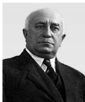
Figure 1. Vladimir Nikolaevich Sukachov.

Professional life and contributions to allelopathy: He did research in Botany, Geography, Soil science, Geology, Biosphere. He was Professor, Leningrad Forestry Academy, Moscow Forestry Institute, Leningrad and Moscow Universities. He was Director, Institute of Forestry, USSR Academy of Sciences in Moscow and Krasnoyarsk.