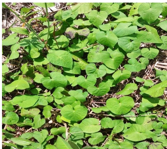
Image 1. Photograph of weed Ipomoea nil (L.) from cultivated fields in Brazilian Cerrado.

agricultural activities contribute more than half of nitrous oxide emitted into the atmosphere (31). Thus, inhibiting the biological nitrification in soil by sorgoleone could be of great environmental significance.