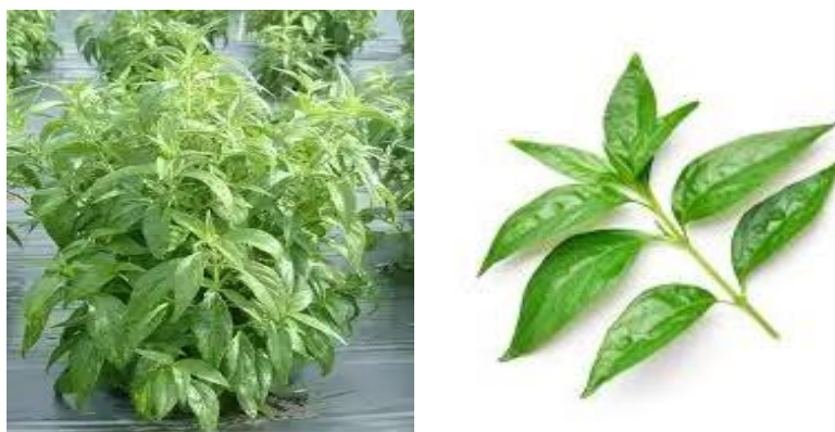
Figure 1. Whole plant and leaf of Andrographis paniculata Nees

A. Andrographis paniculata (Burm. f.) Nees: It belongs to the family, Acanthaceae. It is the most bitter plant in Bihar (27). It is widely used to treat high temperature in fevers and to remove toxins from the body. The plant is recommended to treat alleviation of leprosy, gonorrhoea, scabies and skin eruptions (Figure 1).