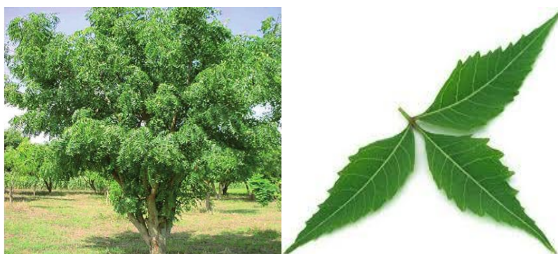
Figure 2. Whole plant and leaf of Azadirachta indica A. Juss

B. Azadirachta indica A. Juss (Family, Meliaceae): It has a wide range of medicinal properties. It has biologically active compounds that are chemically diverse and structurally complex. It is a rich source of antioxidants and treat infections, acne and dandruff. It has antimalarial, antifungal and detoxifying properties (Figure 2).