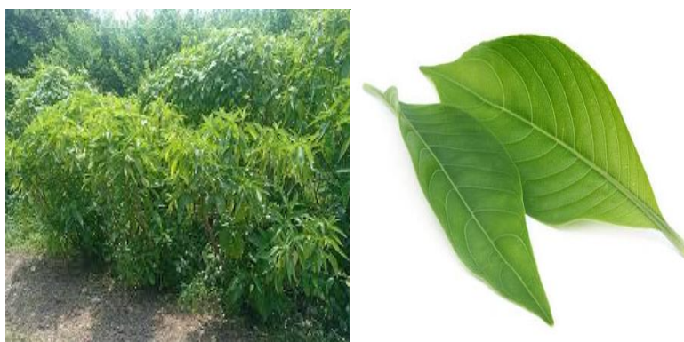
Figure 3. Whole plant and leaf of Adhatoda vasica Nees

C. Adhatoda vasica Nees (Family, Acanthaceae): It has wide applications in traditional Ayurveda as it has anti-inflammatory, anti-allergic and antioxidant properties. Its roots and bark have expectorant properties. It contains alkaloids such as vasicinone and vasicine that have bronchodilator properties. (Figure 3).