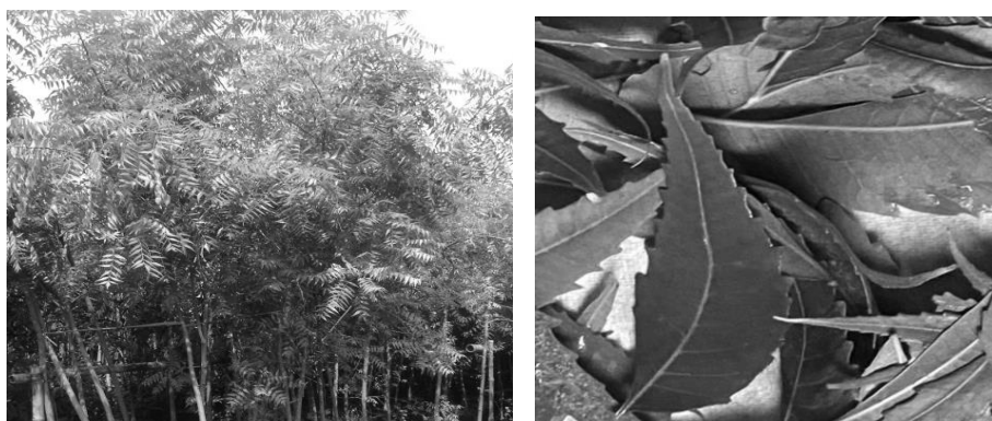
Figure 1. Neem ( A. indica ) Tree and leaves

Neem leaves are known for their antifungal, antibacterial, and insecticidal properties. The neem tree is commonly grown in India and other tropical countries, and its leaves are used in the production of various products, such as soaps, shampoos, and toothpaste. The neem oil derived from the seeds of the neem tree is also used in the production of pesticides, fertilizers, and other agricultural products. Neem leaves are of high economic importance as they can be used as pesticides. Neem leaves contain compounds such as azadirachtin, which have insecticidal properties. They can also be used as animal feed as they are a rich source of protein. The leaves are fed to livestock to improve their overall health and increase milk production. Neem leaves are also used in the production of various cosmetic and personal care products such as soaps, shampoos, and toothpaste. Neem leaves have antibacterial and antifungal properties, making them ideal for use in personal care products. They have been used in the making of traditional medicines. The neem tree is also grown for its timber, which is used in the production of furniture, flooring, and construction materials. Thus, neem leaves have significant economic importance as they are used in the production of a wide range of products (5).