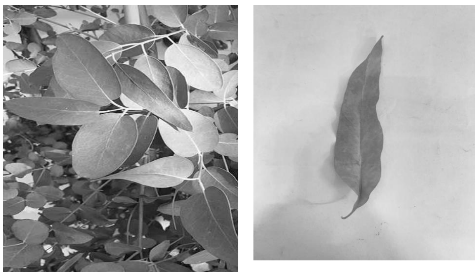
Figure 3. Eucalyptus ( E. globulus ) Tree and leaves

Therefore, Eucalyptus leaves have significant economic importance due to their various medicinal and commercial applications. Overall, the objective of this review is to provide a comprehensive study of the effectiveness of herbal hand sanitizers and to highlight their potential advantages as well as to provide recommendations for their use.