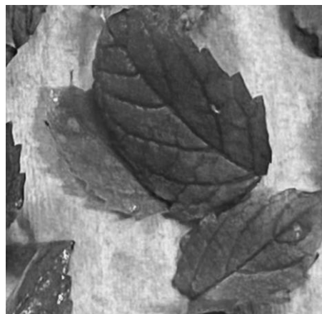
Figure 2. Tulsi ( O. sanctum ) Tree and leaves

Tulsi leaves, also known as Holy Basil, have several economic benefits due to their medicinal and commercial applications. Some of the economic importance of Tulsi leaves include the production of herbal medicines and supplements to treat various ailments such as fever, cold, cough, and respiratory problems. Tulsi leaves contain compounds that have antifungal, antibacterial, and anti-inflammatory properties. They are also used in cosmetics and personal care products. The oil extracted from Tulsi leaves is used in aromatherapy and