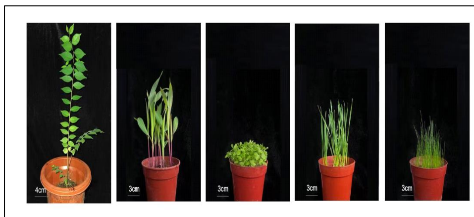
Figure 1. Photographs of one-year old Z. schneideriana and two-weeks old seedlings of the crops. The plants from left to right are Z. schneideriana , Zea mays L, Triticum aestivum L, Brassica rapa C, and Festuca elata K

The one-year old seedlings of Zelkova schneideriana Hand. Mazz were planted in pots (20 cm × 25 cm × 20 cm) with soil substrate and watered once a week during growth. The seeds of maize ( Zea mays L), wheat ( Triticum aestivum L), rape ( Brassica rapa C) and tall fescue ( Festuca elata K) were planted in pots (10 cm × 10 cm × 10 cm) with vermiculite substrate, watered every three days and irrigated with Hoagland solution weekly. All plants were grown in a growth incubator (25 °C, 16 h light/8 h dark photoperiod) (Fig. 1).