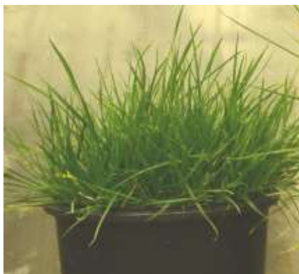
Figure 1. Festuca arundinacea variety Millennium2

An (2) identified two highly allelopathic switchgrass varieties, their root exudates significantly inhibited the lettuce seed germination and plant growth, but the effects varied among ecotypes. Zhang (28) treated Perennial ryegrass , Poa pratensis , and F. arundinacea seeds with root extracts of Imperata koenigii and observed that the allelopathic effects were strongest on Poa pratensis , followed by F. arundinacea and Perennial ryegrass . Gao (6) reported that the Conyza canadensis leaf aqueous extract variably inhibited the seed germination and seedling growth of five crops (rape, radish, cucumber, sorghum and wheat), the rape and radish were more sensitive than sorghum, cucumber and wheat. Wang (21) studied the allelopathic effects of eight P. pratensis varieties on Perennial ryegrass seedlings, and found that P. pratensis variety Kentucky had the strongest effects, followed by Platini and Park varieties. Therefore, comparing the allelopathic effects among the species and varieties is important to improve the plant growth (8).