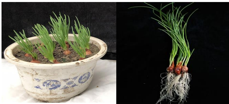
Figure 1. The photograph of potato-onion plant.